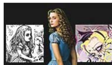
Why we just can't get enough of 'Alice'