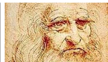
Leonardo da Vinci getting action movie makeover