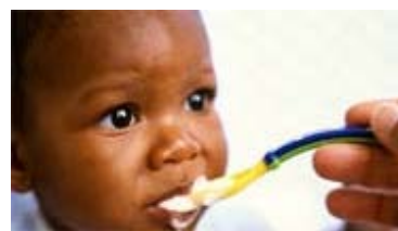
Obesity risks start before birth