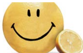
Finding happiness in a bottle of perfume