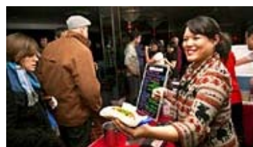
Pop-up eateries a hit with New York's hip | Photos